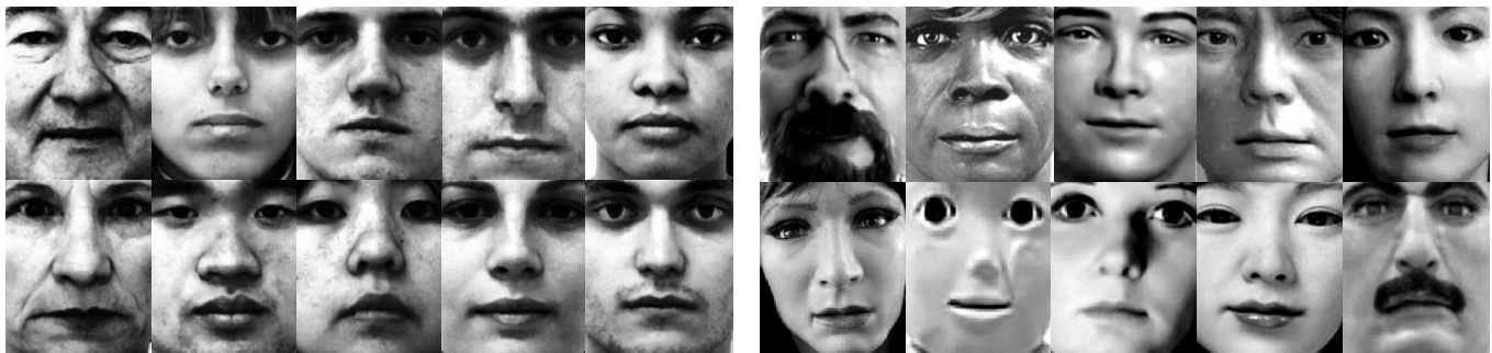
Figure 1 – Face images used in our study, human faces on the left and android faces on the right. The human faces are extracted from the FEI face database ( http://fei.edu.br/~cet/facedatabase.html ). We compiled the android faces through sources available online. From left to right, top row first: Hanson Robotics’ Philip K. Dick, Bina 48, Jules ( http://www.hansonrobotics.com/ ), ATR Geminoid and Geminoid F. Second row, FaceTeam FACE robot [18], JST ERATO Asada and Kokoro CB 2 , Neurobiotics Alissa, KITECH Ever-2, National Taiwan University Robot (unnamed).

We compiled a database of faces, consisting of ten android and ten human faces, with half of each category being female. Faces were selected as much as possible to have a neutral expression and to be fully front-facing. Figure 1 shows faces used and provides source attributions. All images were scaled to 324x386 for consistency across faces, which was 3.4” x 4.5” on our screen. For the post stimulus verbal questions, for task 1, we asked the participant to rate how “eerie” the image was on a scale of 1-7.