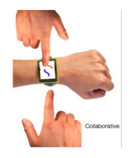
Figure 2. The HWD camera can sense the direction of finger landing on the smartwatch for multi-user sensing.