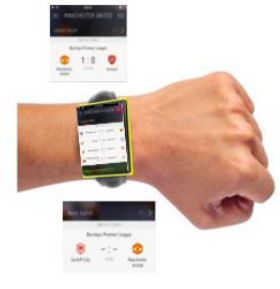
Figure 4. Spatially arranging the displays allows for semantic presentation of content.