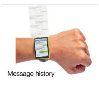
Figure 3. Combining both displays can extend the overall display space of the devices.